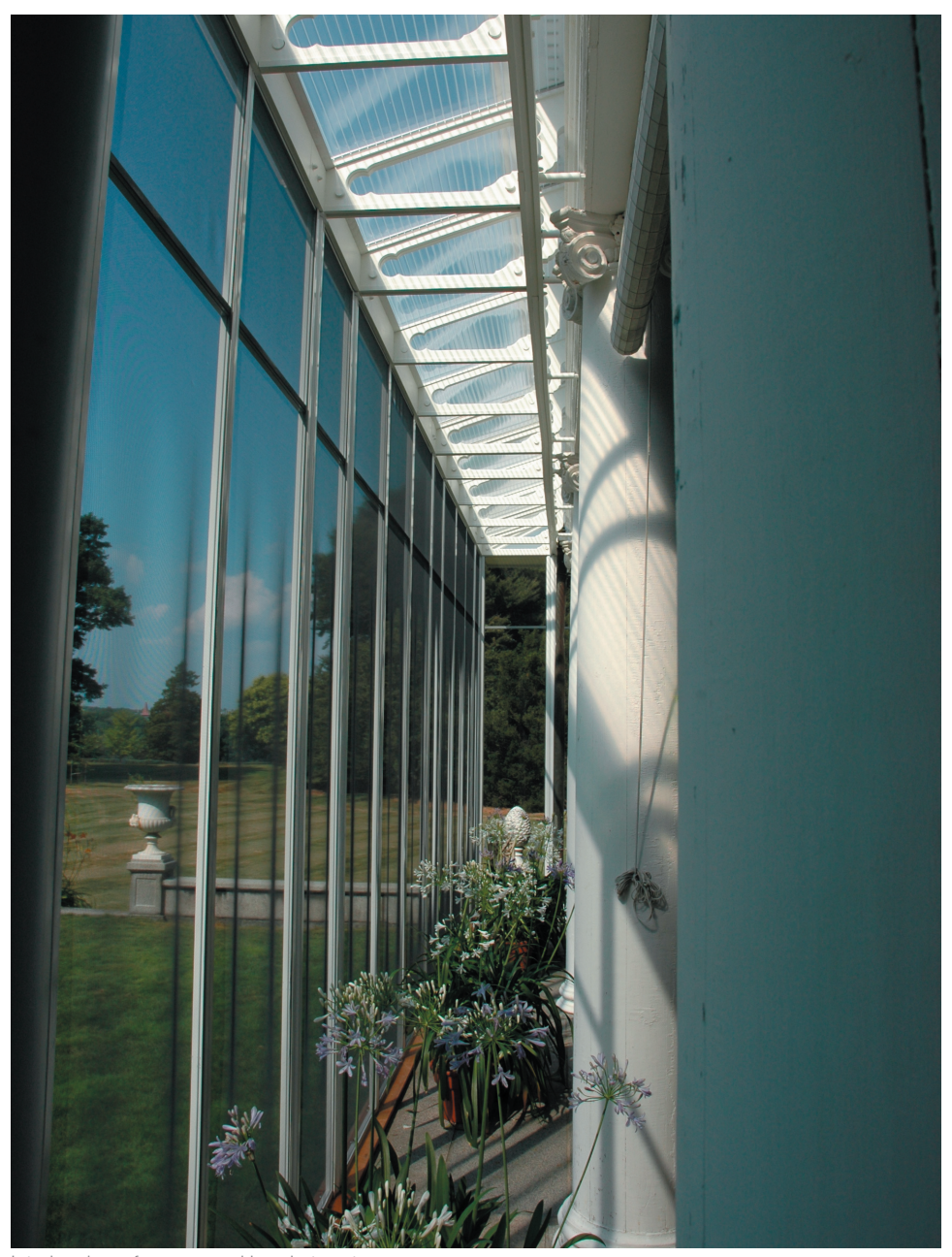
Interior view of screen and bracket system.