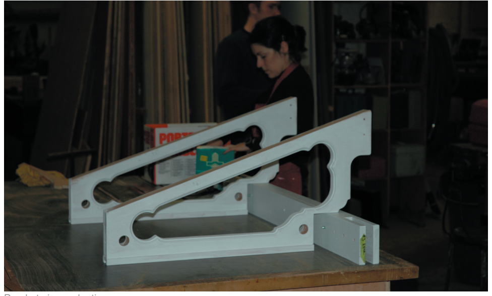
Brackets in production