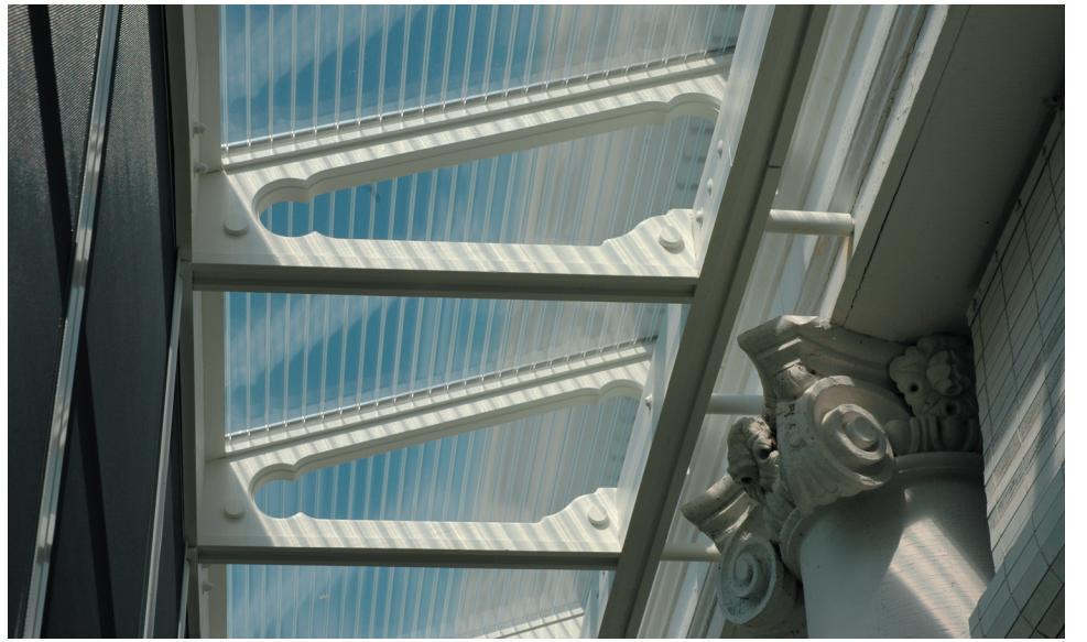
View of transparent visor and adjustable standoffs