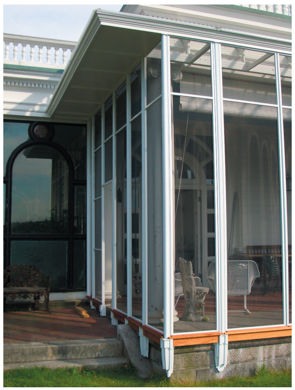
View from garden of corner with soffit transition